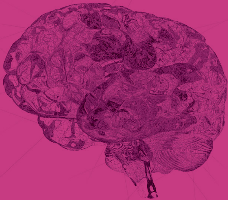
Ilustracija & oblikovanje: Klemen Trupej